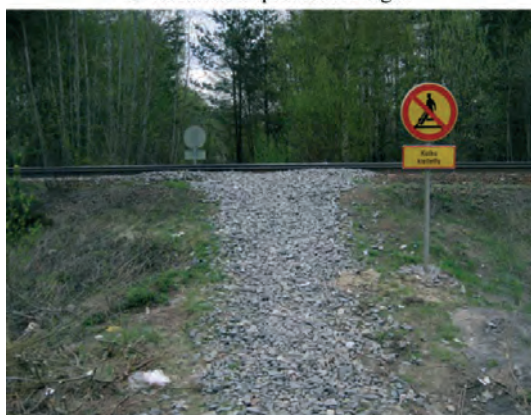
Fig. 1. Pictures of research sites after the implementation of countermeasures. (A) Location of landscaping. (B) Location of fencing. (C) Location of prohibitive signs.

were small and not easily detectable by trespassers—one was placed under the eaves of a building and two others about 4 m up two electricity poles. The cameras were therefore assumed not to influence people's behaviour. The motion detectors covered the path used by trespassers with its surroundings, and whenever movement was detected the camera took 15 digital pictures at intervals of 1 s. The camera functioned independently and only required the batteries to be changed once a week.