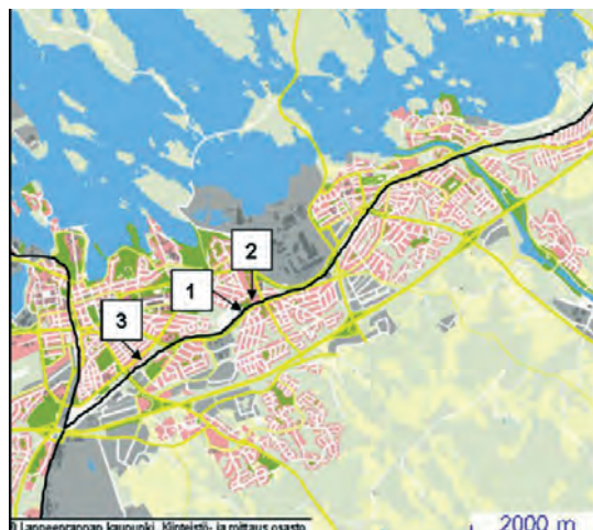
Fig. 2. Map of the city of Lappeenranta (City of Lappeenranta, 2007). The black line from bottom left to upper right shows the railway line including both passenger and freight traffic. The numbers show the research locations: (1) landscaping, (2) fencing and (3) prohibitive signs.

were small and not easily detectable by trespassers—one was placed under the eaves of a building and two others about 4 m up two electricity poles. The cameras were therefore assumed not to influence people's behaviour. The motion detectors covered the path used by trespassers with its surroundings, and whenever movement was detected the camera took 15 digital pictures at intervals of 1 s. The camera functioned independently and only required the batteries to be changed once a week.